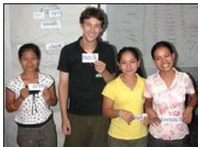
Absolute Beginner English

Finally, the English team would like to extend a deep appreciation to the College Writing Programs Department at the University of California at Berkeley for their generous donation of three boxes of ESL textbooks and resources. This extensive collection of new media and will enable us to further diversify our lesson content.