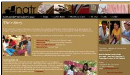
Tsunami Crafts website

It's been a busy month for our volunteer webmasters! The fruits of many months' worth of planning and late night work were realized this month with the much-anticipated launch of two new websites. Just in time for holiday orders, our Tsunami Craft Shop ( www.tsunamicrafts.com ) is now online and open for business. Check out the beautiful assortment of hand-crafted soaps, tie-dyes, model boats, and cards, and help make a difference in the lives of tsunami-impacted villagers.