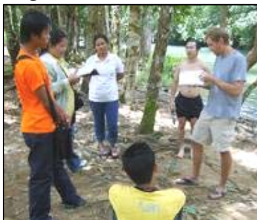
ACE English/Community Trail

This month ACE Expert English left the classroom to explore the “community trail”—a guided tour of village highlights—for additional English practice. This effective learning technique places students in real-life village settings, providing an excellent opportunity to practice the English vocabulary and language that they'll encounter as guides and tourism professionals. We intend to continue this type of lesson through the remainder of ACE training, in conjunction with classroom conversation and speaking using all the relevant language covered in the course.