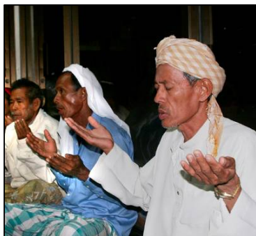
Muslim Men Praying

We have received a number of emails expressing concern for the recent military coup. The coup, however, has had very little effect on our work – less effect than the holidays mentioned below, in fact. For the most part, Southern Thailand had very few supporters of the recently deposed prime minister. Since NATR's mission focuses on community-level development, and since I am not a native son of Thailand, it is not our place to comment on the benefits or drawbacks of the coup. Instead, we will continue to help local villages strengthen themselves, so they may advocate for whatever form of government they see fit.