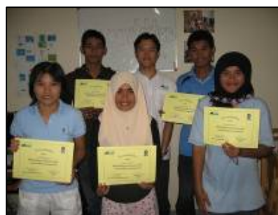
Computers Class graduates